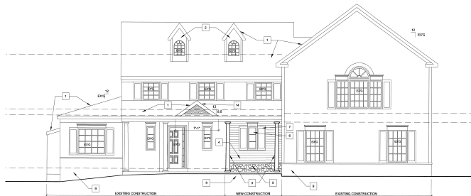
1 FRONT ELEVATION 1/4" = 1'-0"

THIS DRAWING IS A COPY OF THE ORIGINAL DRAWING AND IS NOT TO BE USED FOR CONSTRUCTION. ANY CHANGES TO THIS DRAWING MUST BE APPROVED BY THE ARCHITECT.